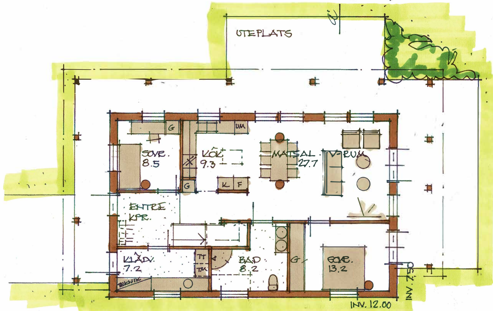
ENTREPLAN. BOA 90,0m 2 (INV. AREA) BYA 149,5m 2 + 32,8m 2